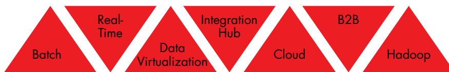
Figure 2. Deployment Flexibility: Map Once, Deploy Anywhere.

Informatica's data infrastructure platform supports a wide variety of data integration technologies (see Figure 2) that range from free entry-level solutions to easy-to-use cloud product offerings to enterprise-class high-availability, real-time, and Hadoop-based deployments. Additionally, Informatica supplies portability across these environments so integration jobs developed to run on batch, for example, can be moved to run on Hadoop with virtually no rework required. Our technology and your organizational needs evolve together.