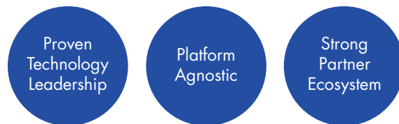
Figure 3. Operational Confidence: Proven Customer Success

More than 5,000 successful customer deployments —and seven consecutive years of top ratings in customer loyalty rankings—prove that Informatica's combined data integration and data quality technology, pioneering best practices, and world-class support and services (Figure 3) provide a solid foundation for turning data into strategic advantage.