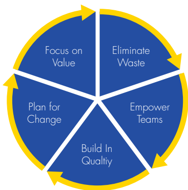
Figure 2: Lean integration principles drive continuous improvement and optimize the entire IT organization.

Moving up the maturity curve is contingent on a lean integration strategy . Lean integration is based on proven lean manufacturing methods that synchronize people, processes, and materials to eliminate any waste of effort or resources. Lean integration puts into place processes, standards, technology, and resources to maximize IT operational efficiencies, as shown in Figure 2. It provides IT organizations with the tools needed ensure continuous improvements in the management of data and applications within the agency.